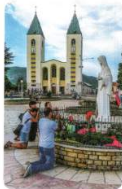
PHOTOGRAPH OF THE STATUE OF OUR LADY OF MEDJUGORJE, BISHOP AND HERMITS OF THE SACRAMENTS, MEDJUGORJE

It is important to note whether the private revelation is contrary to the faith or the morals of the Church, and whether a particular revelation brings one closer to God. ●