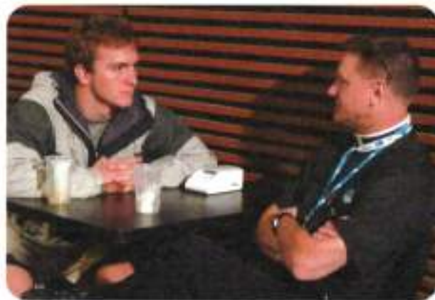
A pilgrim takes time during a World Youth Day event to speak with a priest about vocations.

If you are truly open to the will of God in your own life, if you are willing to listen to God’s call and make your decisions and choices based on this experience, preferably with the guidance of a confessor or spiritual director, you will discover the true happiness that a real vocation can bring. ●