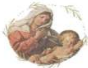
This children dear to me Lift Your Redeemer —Bernini, 1633